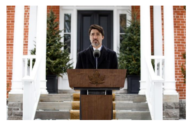
Prime Minister Justin Trudeau holds a press conference outside him home in the early months of the pandemic.

In addition to our advocacy work, we contributed a chapter on Tax Fairness for the CCPA's special <u>Alternative Federal Budget Recovery Plan</u>. In it, we outline how progressive taxes can help reduce the deficit and rising inequality. Some of our proposals include taxing foreign digital giants and introducing an excess profits tax on large companies that have profited during the pandemic.