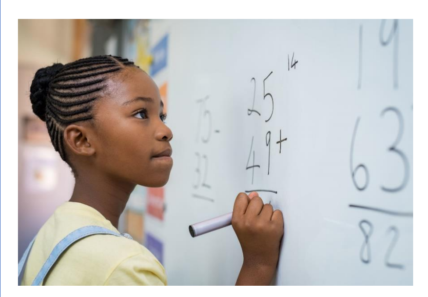
By making the tax system fairer, Canada can afford to invest in quality public services such as education and childcare.

Strengthen the economy: Deep successive corporate tax cuts have contributed to record corporate profits — not the investment and growth promised. Removing unfair tax breaks for corporations and the rich while lifting vulnerable families out of poverty can help the economy by boosting consumer demand, supporting Canadian businesses and creating jobs.